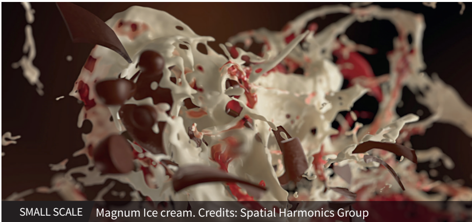
SMALL SCALE Magnum Ice cream. Credits: Spatial Harmonics Group