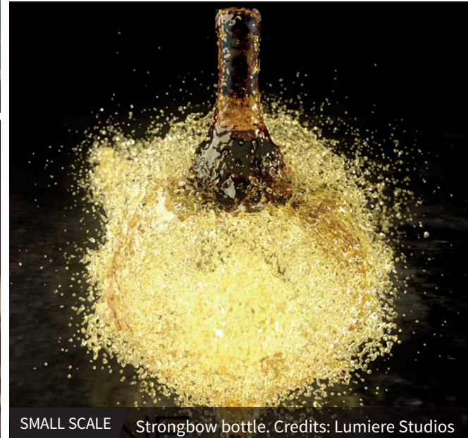
SMALL SCALE Strongbow bottle. Credits: Lumiere Studios